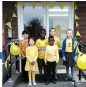
Wearing yellow to support World Mental Health Day